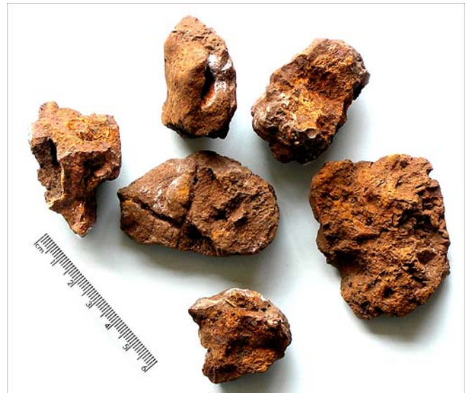
Slag found on the South Downs near Alfriston

An iron ore, Iron Sulphide (Marcasite FeS_2 ), is found as isolated nodules in the Middle Chalk, either spherical or rod-shaped. As these nodules are not found in a mass it is difficult to find a useful amount unless a rock-falls occur on a beach, such as the cliffs west of Eastbourne, Sussex.