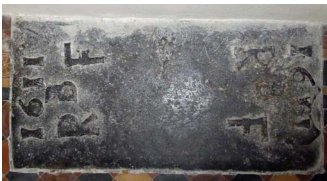
Little Wenlock, Shropshire, graveslab of 1611