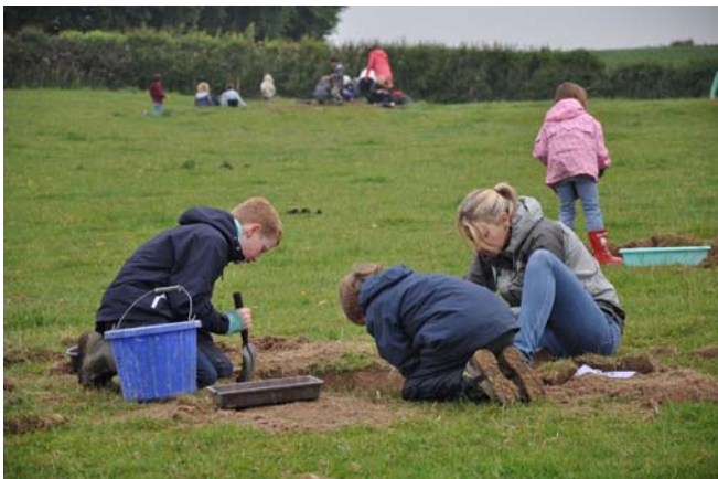
Young archaeologists at Stiances

With the aid of professional archaeologists, teachers and classroom assistants from the school,