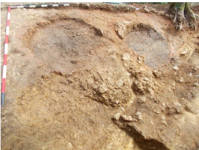
The bases of two bloomery furnaces in Thorp's Wood, Brede

In Trench 1, a good deal of slag and areas of burnt clay and charcoal were carefully removed and the different layers recorded until the final layer revealed the bases of two iron smelting furnaces, one above the other. It is likely that there were more furnaces in this location owing to the amount of slag, furnace lining and burnt material but they had not survived as well as the two in Trench 1. An unusual gully type feature was also found running across in front of the furnaces, and had been filled in with slag.