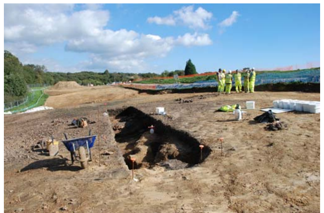
One of the exploratory trenches into the slag heap along the route of the Bexhill-Hastings link road.

The area around Upper Wilting Farm is rich in the remains of ironworking from the late-Iron Age and Roman periods, with the sites at Beauport Park, Crowhurst Park, Fore Wood and Bynes Farm nearby.